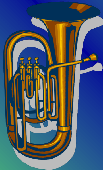
Baritone & Tuba