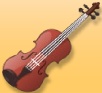
Violin & Viola